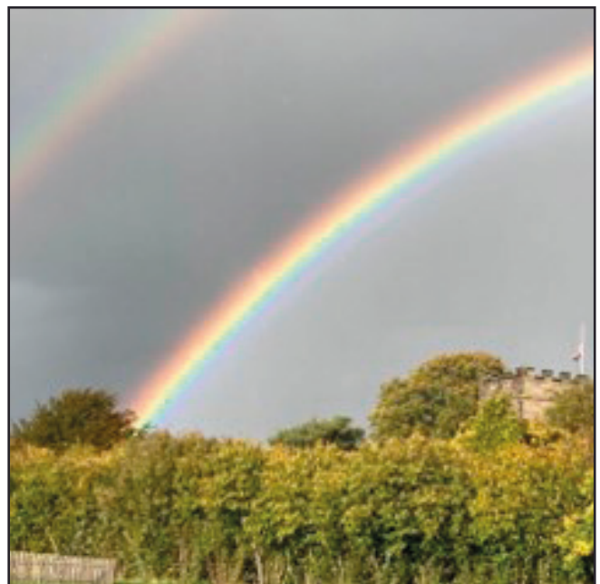
Beautiful rainbow over the village

Again, please contact Editor and I can arrange to put you in touch. editor@packington.info