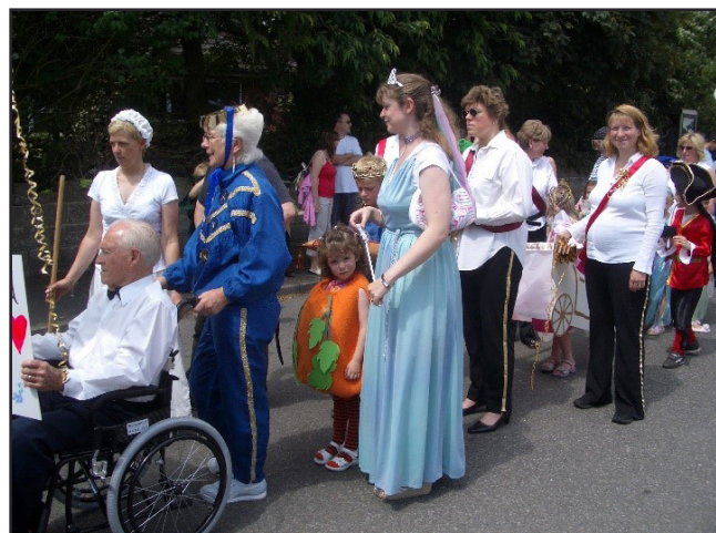
Packington Carnival 2005

If we obtain enough material of general interest PVHG may put on an exhibition at the Memorial Hall this winter for villagers and local residents of all ages to come and see our records of last century's biggest annual social event in Packington. So, please check out your memories, your family photo albums, your lofts and attics for long forgotten photographs, colour slides and 8mm film and any other memorabilia of this now bygone age, and get in touch.