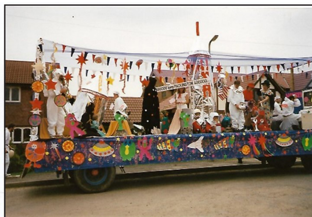
One of the many colourful floats that paraded at the Packington Carnival.