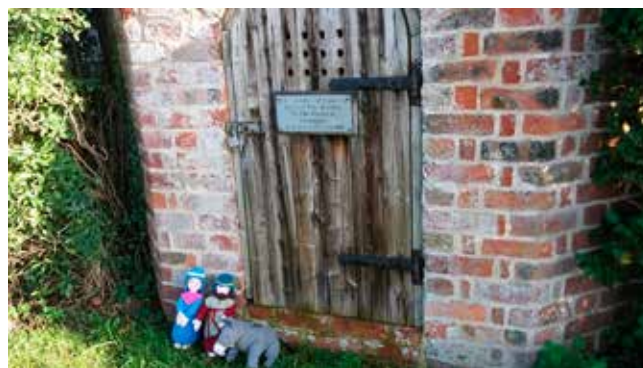
Mary & Joseph visiting Packington

We're glad this enterprise gave a lot of pleasure to a lot of people.