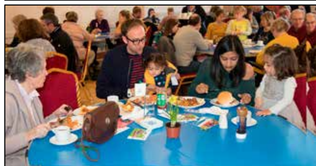
THANKS TO ALL WHO HELPED MAKE IT A SUCCESS