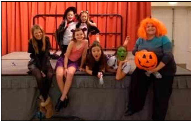
Enjoying the Halloween party

Youth Club started off this half term with a full programme of events, which everyone enjoyed. Our activities have been planned and carried out by our junior leader team. These included the ever-favourite Dodgeball Skittles alongside the making of Insect Hotels and our ever-popular Halloween Party, which included amongst others the Dress the Mummy race, Apple Bobbing, Scary Story game and Best Dressed Character.