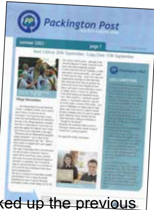
Right: Cover from first edition

When you picked up the previous issue of "Packington Post" from your letter box, and, scanned the front page for all the village news, or sat down (with a cup of coffee?) to make a mental note of future events, did you ever wonder who (and what) was involved in assembling, printing, and delivering each copy to you, every two months?