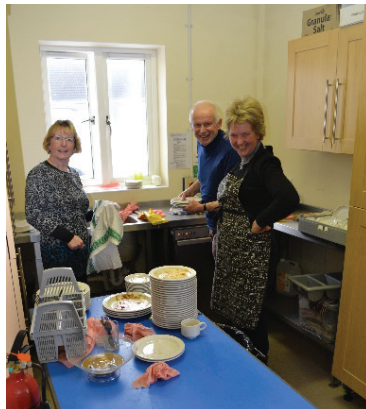
Just one of the teams on washing up duties.

CELEBRATE Good News editor@packington. info