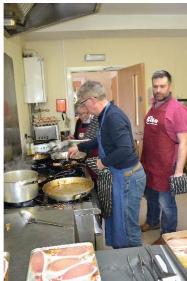
The cooking team hard at work.