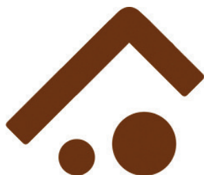
New Logo for Packington Memorial Hall Venues