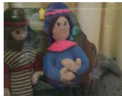
Above knitted figures of Mary and Joseph.

Mary and Joseph start their journey to Bethlehem on December 3 rd