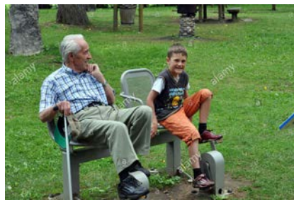
Above: Example of All-Age Gym Fitness Station

Our next meeting scheduled at the end of November will be for the Trustee working party to look at cost, feasibility and providers.