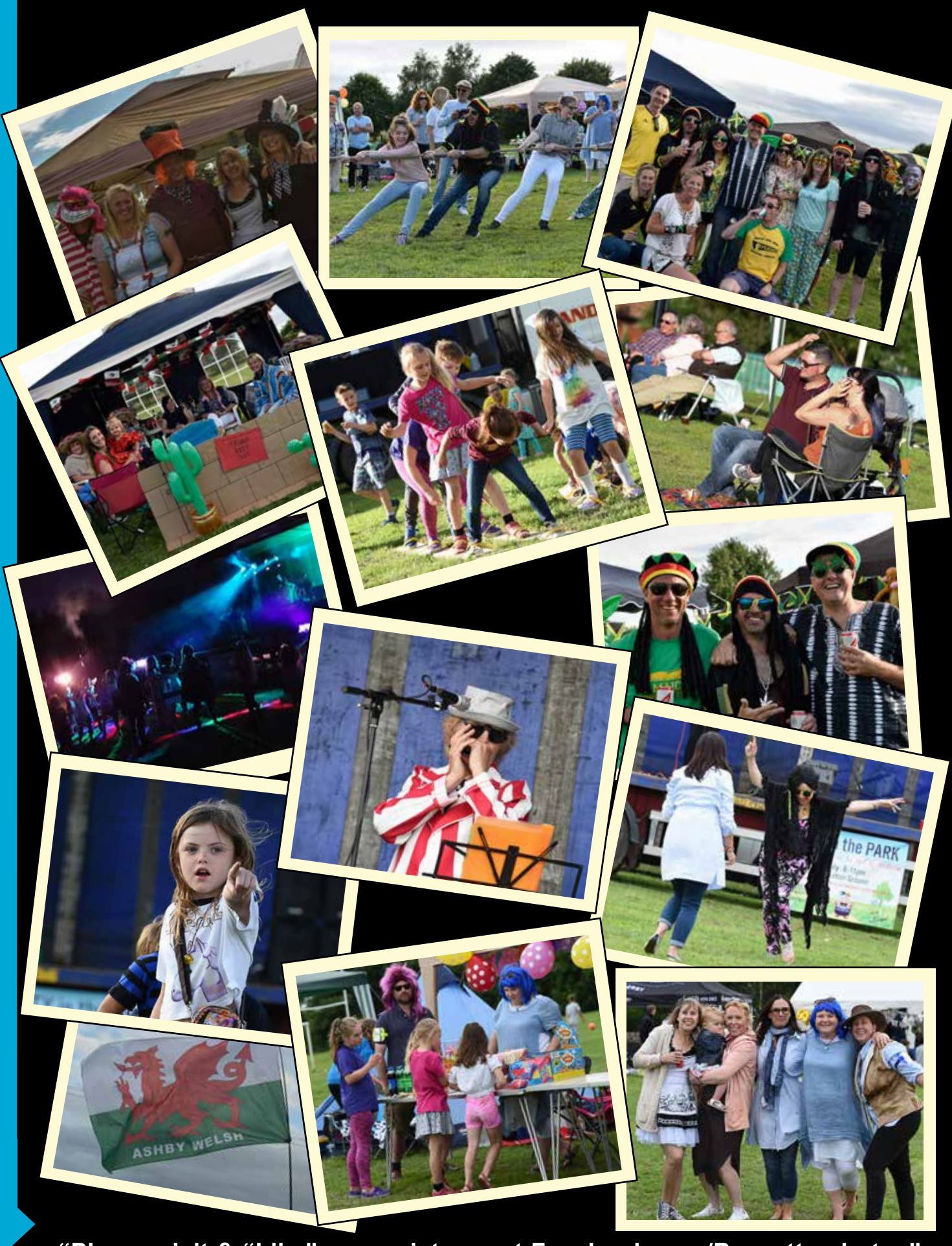
"Please visit & "Like" more pictures at Facebook.com/Bassetts photos".