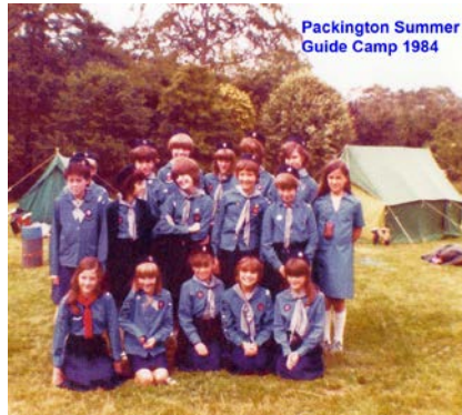
Packington Summer Guide Camp 1984

Annual summer camps, two being International camps at Stanford Hall.