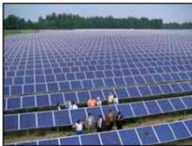
The image above is for illustrative purposes only

Public Consultation held for proposed Solar Farm next to Sewage Farm, Packington.