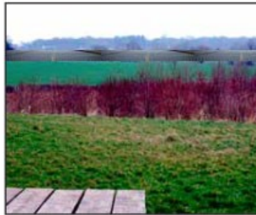
Above: Potential view from Normandy Wood Picnic Area when solar farm in place