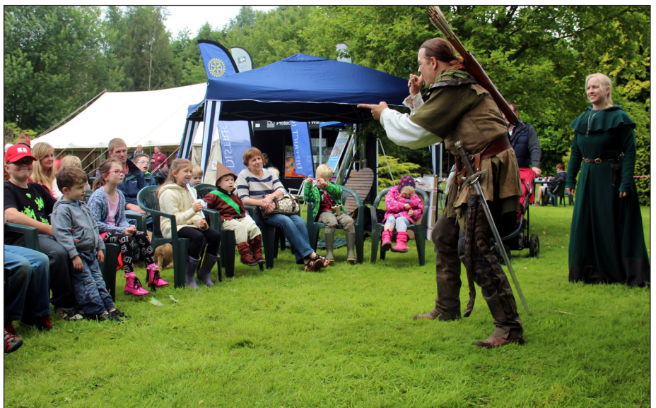
Robin and Marian enthraling the crowd of kids & Big kids!!