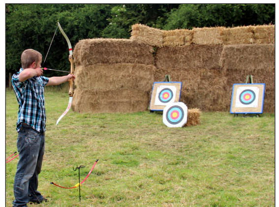
Archery for all organised by the Scouts