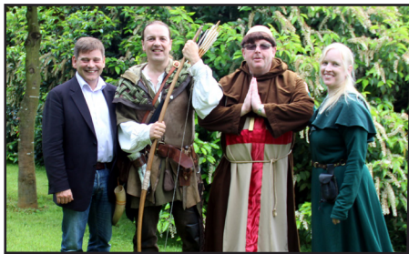
Friar Tuck praying for good weather