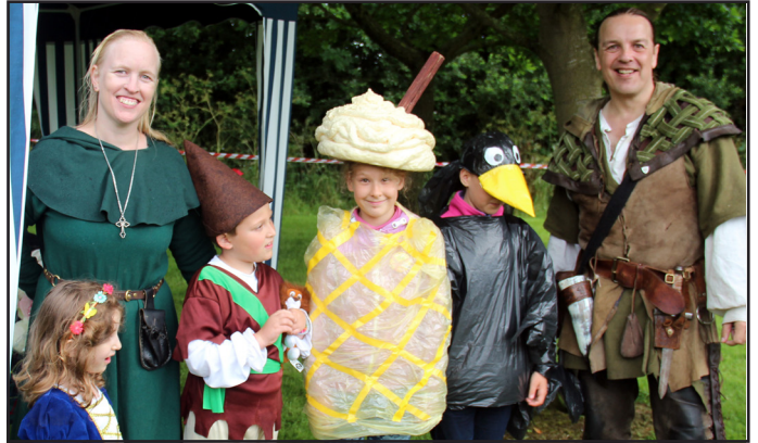
The prize winners of the fancy dress – the duck is clearly camera shy and the elf is about to propose to the “99” ice cream!!!