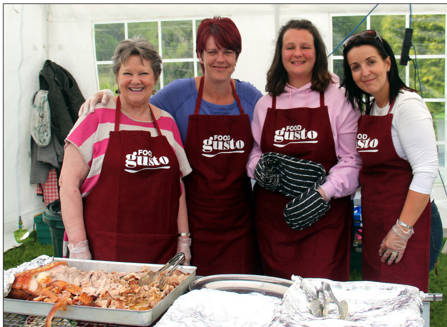
Many thanks to Food Gusto and volunteers for providing a superb Hog Roast all served with a smile