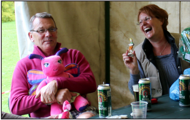
The Flocks from Mill Street obviously looking forward to playing with their toys!!!