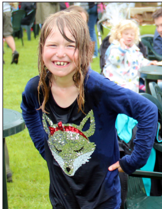
Even the rain could not dampen spirits