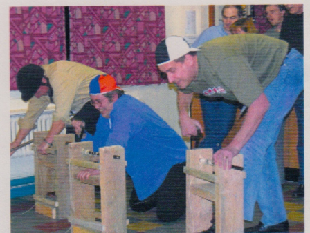
Jockeys race for the line at PEG Race Night, Memorial Hall. (Money raised was donated £300 to School Building and £300 to Packington development partnership)