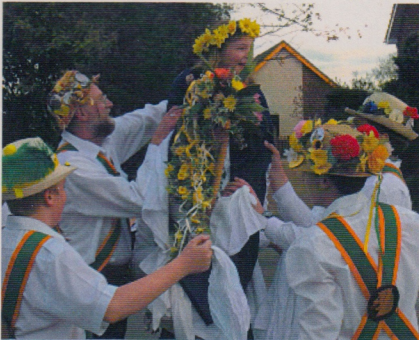
Annual May Queen celebrations at the Bull and Lion. 1st May 2003

Next Edition 30th September. Copy Date 15th September