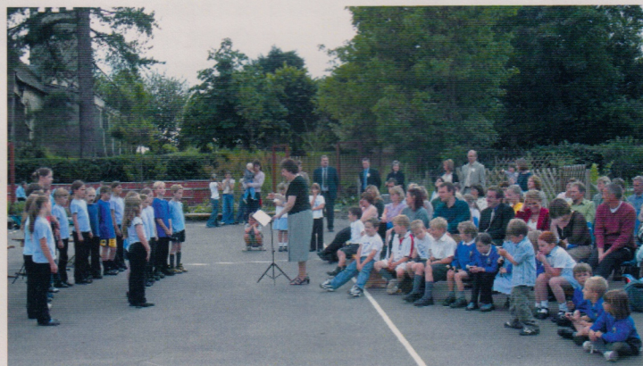
An evening of Celebration at Packington Church of England Primary School. July 2003