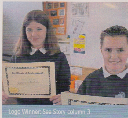
Logo Winner: See Story column 3