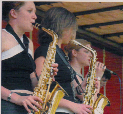
A big thankyou to all the Packington Picnic organisers for another great day!